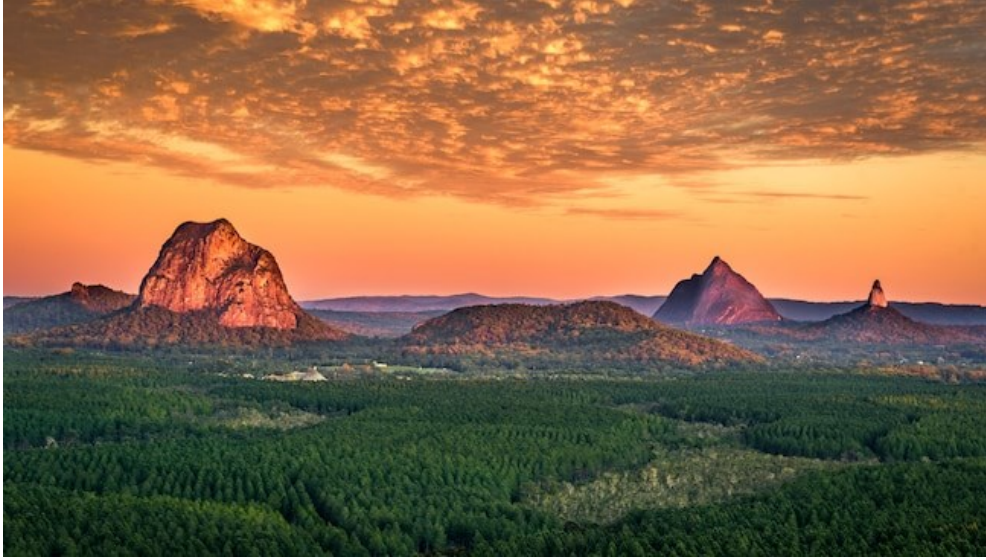
The Glass House Mountains on Queensland's Sunshine Coast. File image.