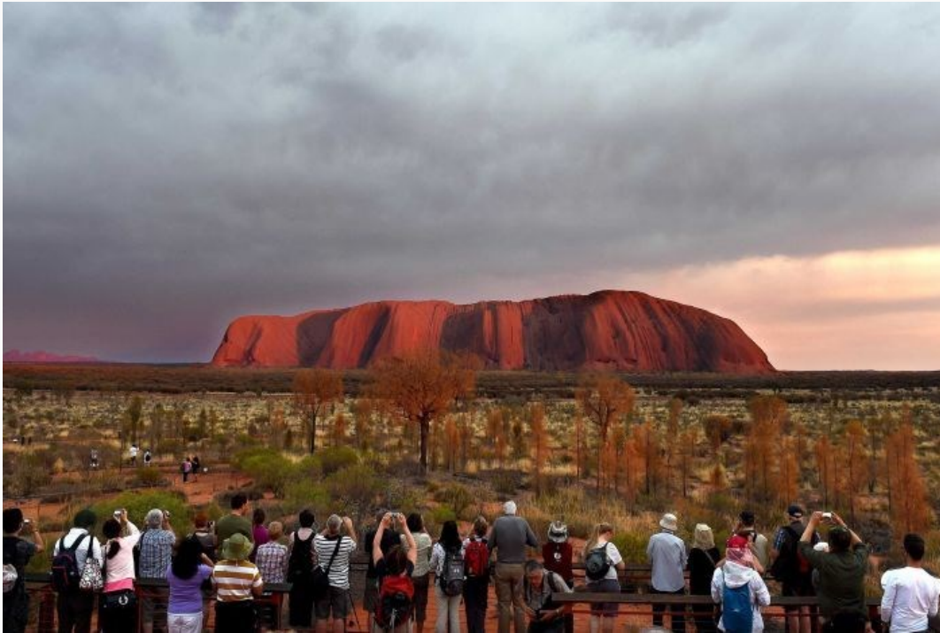
PHOTO: The Uluru-Kata Tjuta National Park board of management has officially closed the climb up Uluru.

Almost 34 years to the day since the Anangu traditional owners were handed back the title to Uluru, their wishes that people not climb the rock will now be enforced by law.