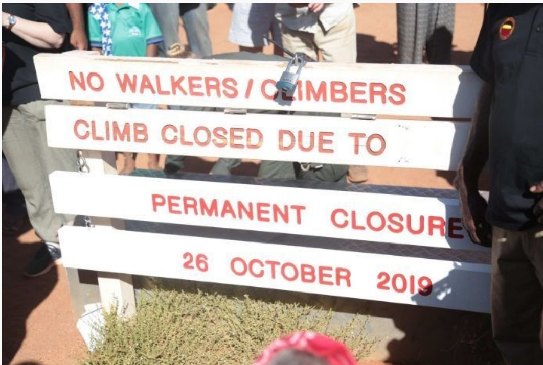
PHOTO: A sign at the base of Uluru confirming the landmark's permanent closure.

Uluru is a sacred site and of great spiritual significance to First Australians, and Anangu traditional owners say climbing it is not only disrespectful but also dangerous.