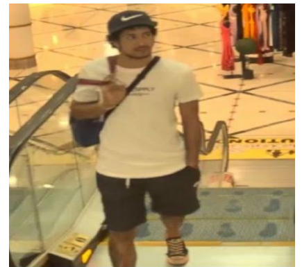
McLeod Street, Cairns City