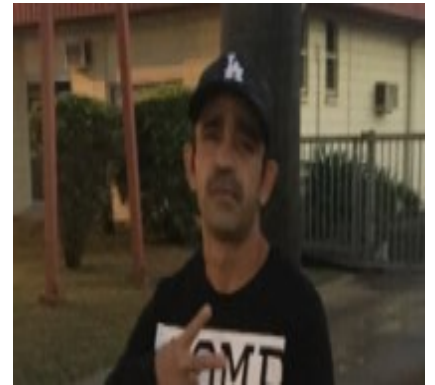
Missing man, Babinda