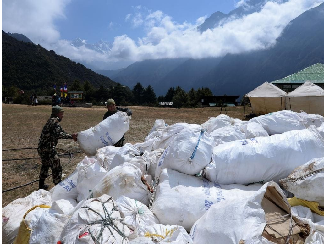
📷 Nepali Army personnel collect waste from Mount Everest at Namche Bazar in Solukhumbu district.

“I saw some climbers without basic skills fully relying on their Sherpa guides. The government should fix the qualification criteria,” she said in Kathmandu’s general hospital, all the toes on her left foot black and blue and her face weatherworn.