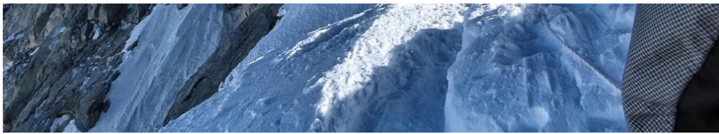
📷 Climbers snake around Mount Everest.