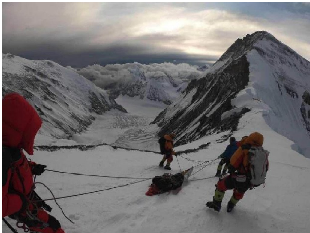
📷 This image shows the Aussie climber being rescued on Mount Everest.

The American's death takes the number of people who have perished on the mountain over the past 10 days to 11.