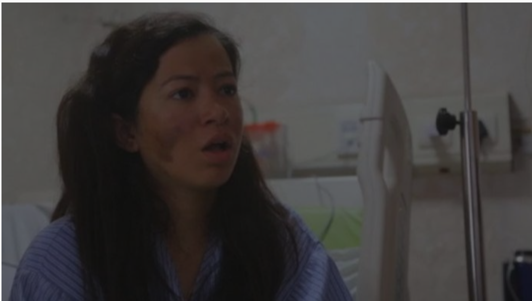
VIDEO: Mountaineer says inexperienced climbers created problems on Mount Everest (ABC News)

Most of the deaths on Everest have been blamed on exhaustion, exacerbated by the crowded route to and from the summit on the Nepalese side.