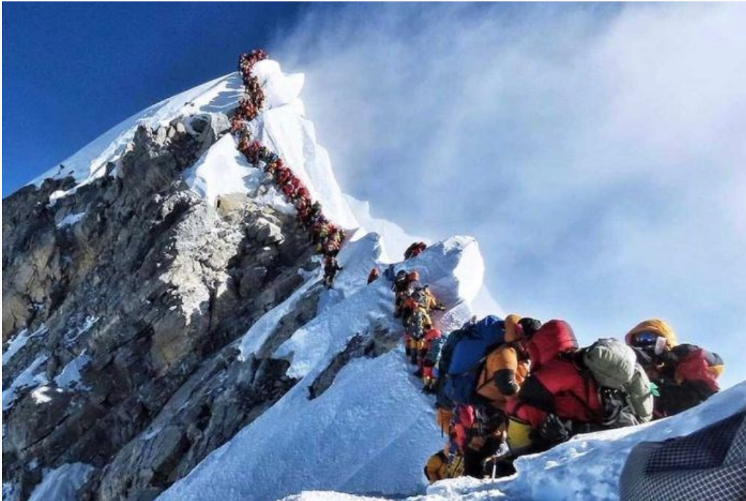
PHOTO: Climbers wait in line to summit Mount Everest on the Nepalese side of the mountain. (Nirmal Purja/ @nimsdai)

A record number of climbers have died or gone missing on Mount Everest since the beginning of the season.