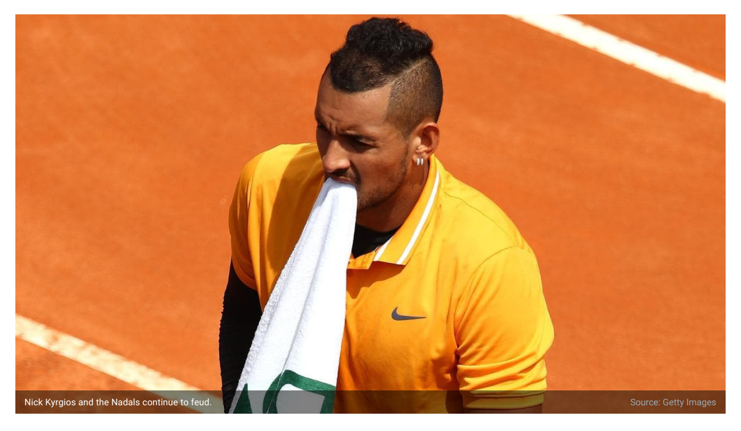
May 18, 2019 1:48pm

The war of words between Rafael Nadal's camp and Nick Kyrgios has continued, with the Spaniard's uncle and the Australian now exchanging barbs.