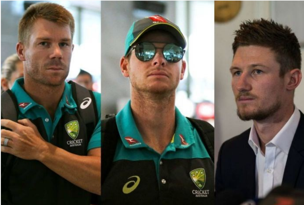
PHOTO: David Warner, captain Steve Smith and Cameron Bancroft were caught in the middle of the ball-tampering scandal.

The executive of the Australian Cricketers' Association says Cricket Australia has a "moral obligation" to lift the bans of former Test captain Steve Smith, vice-captain David Warner and batsman Cameron Bancroft over the ball-tampering affair.