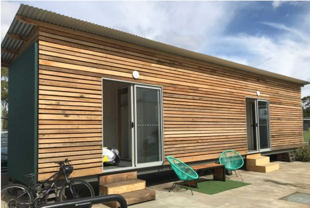
PHOTO: A shipping container converted into a tiny home.

For a new container, expect to pay at least $5,000.