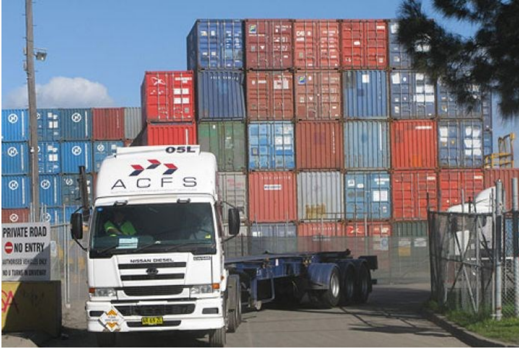
PHOTO: Second-hand shipping containers can make for a risky home or shed, because you don't know what damage it has suffered before it made it to your property.

For instance, a container could have been used to carry fertiliser, poisons, food or stuffed toys.