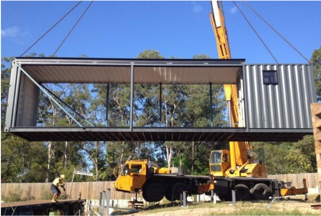
PHOTO: There is plenty to love about a shipping container home, but what are the dangers and what does it cost?

They are the heavy metal boxes dotting properties across the country that have morphed into self-contained coffee shops or boutique food outlets.