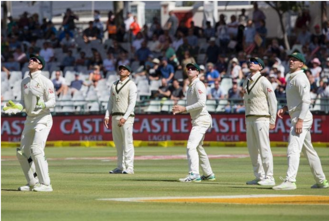
PHOTO: Australian cricket has lost its moral high ground following the team's antics in Cape Town.

"The rules are in place for a reason, if you're not going to use them, why bother having them?"