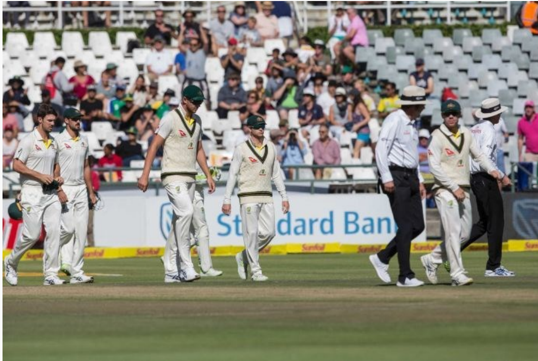
PHOTO: Steve Smith marched out on day four having been stood down as captain.

The Australian ball-tampering scandal has opened Australian cricket to global accusations of hypocrisy given the team's actions throughout the damaging series in South Africa.