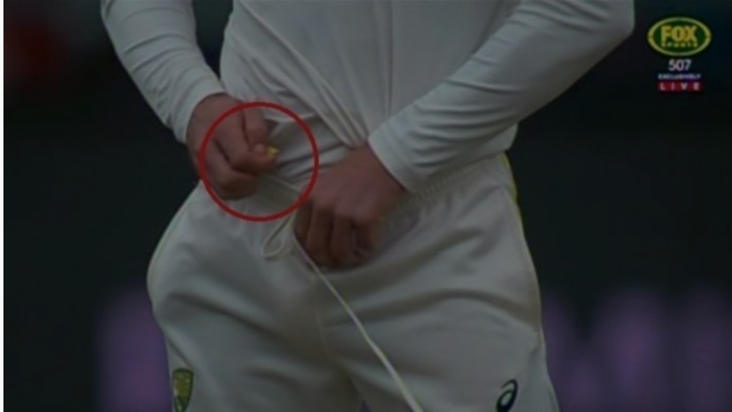
VIDEO: Cameron Bancroft is seen holding a yellow object.

"It shouldn't happen. Banter, that's fine. Banter is good-natured fun by crowds but they've gone too far here ... it's been poor."