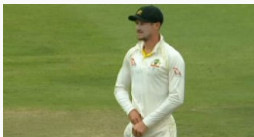
Australian cricket team captain Steve Smith and senior players planned the ball-tampering plot during a lunch break. This is how it played out.