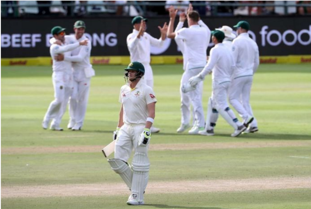
PHOTO: Steve Smith trudges off after Morne Morkel struck again in the final session on day four.

Australia's shell-shocked Test team wilted under Proteas pressure in a 322-run loss to South Africa in Cape Town as the ball-tampering fiasco proved far too big a distraction.