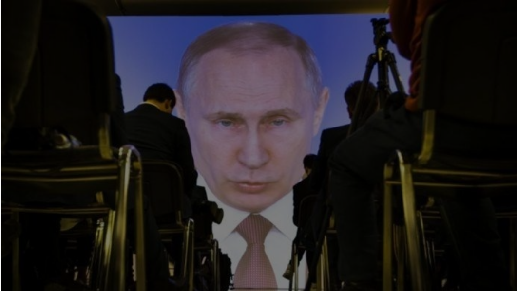
VIDEO: President Vladimir Putin boasts of Russia's unstoppable nuclear weapon

President Vladimir Putin says Russia has tested an array of new strategic nuclear weapons that cannot be intercepted.