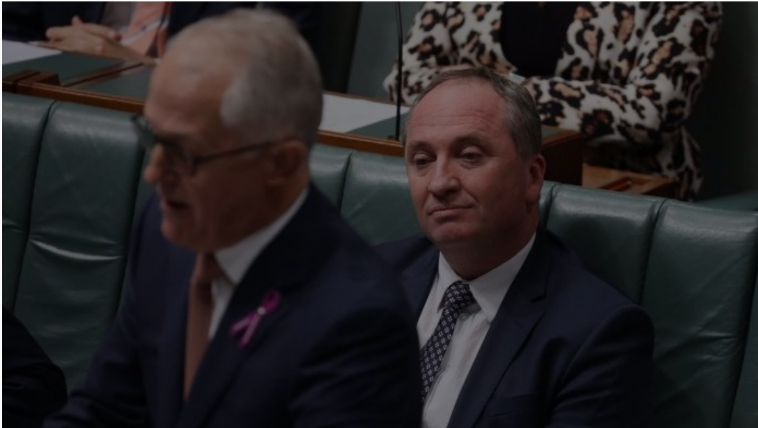
VIDEO: Prime Minister bans sexual relations between ministers and staff.

An uncomfortable gulf has been exposed between the Prime Minister and his deputy , after Malcolm Turnbull delivered a scathing dressing down in which he refused to endorse Barnaby Joyce and told him to consider his position.