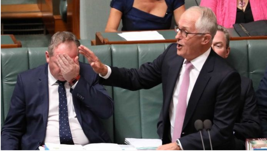
VIDEO: Malcolm Turnbull announced in Question Time his deputy would be on leave next week.

Mr Joyce is digging in — and his National colleagues are publicly backing him — but his future in politics remains very unclear.