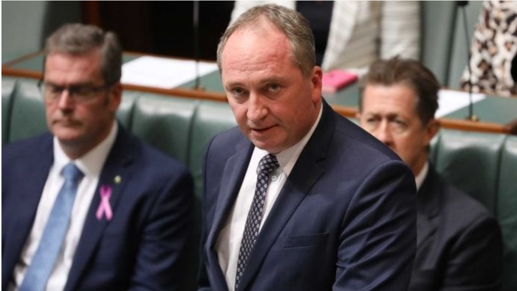
VIDEO: Barnaby Joyce told Parliament he was approached by a friend with the accommodation offer.

But questions remain about Mr Joyce accepting the use of an apartment rent-free for six months .