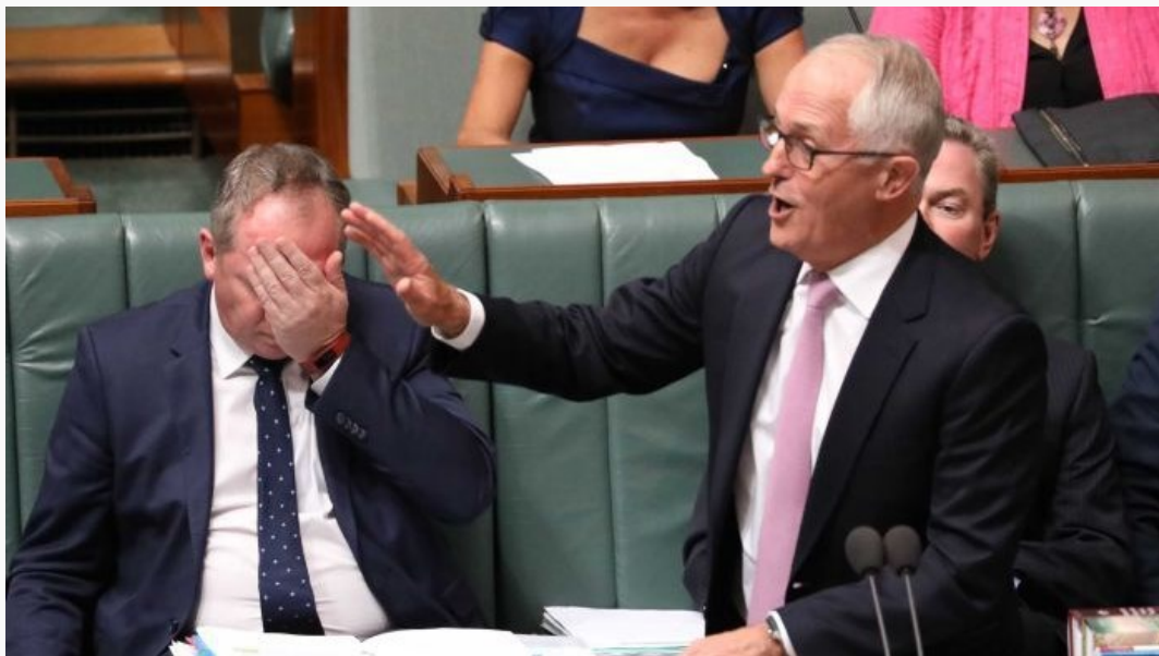
VIDEO: Malcolm Turnbull announced in Question Time his deputy would be on leave next week.

"He needs to make a new home for his partner and their baby that is coming in April."