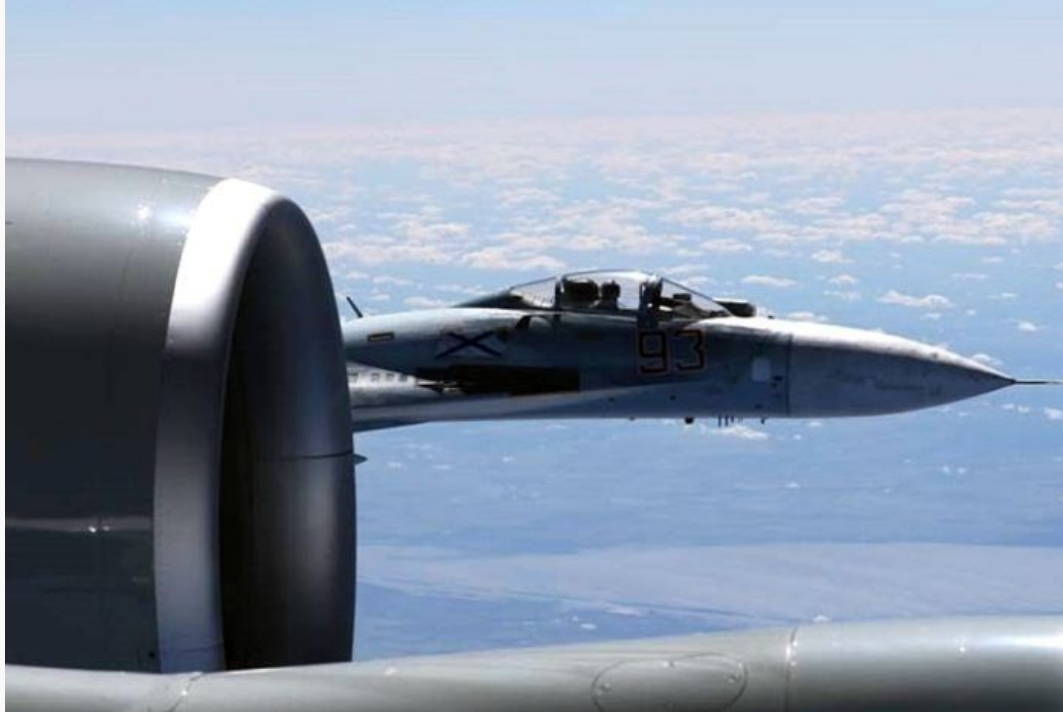
PHOTO: A Russian jet is seen coming within a few feet of a US jet in a similar incident over the Baltic sea.

The Pentagon has stepped up its reconnaissance flights in the Black Sea since 2014 when Russia seized Crimea .