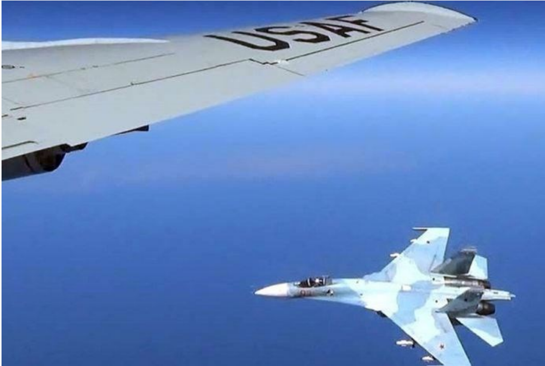
PHOTO: A Russian fighter flies alongside a US aircraft over the Baltic sea in an image released by US European Command (US European Command)

The US Navy has denounced the "unsafe" actions of Russia's military after a Russian SU-27 fighter jet flew within 1.5 metres of a US surveillance plane over the Black Sea.