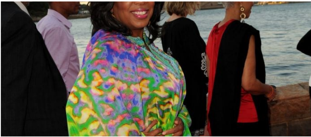
PHOTO: You can't blame Winfrey if she's enjoying the fuss.

Just as Mr Trump has done immeasurable damage to the Republicans, however, Winfrey could inadvertently harm the Democrats.