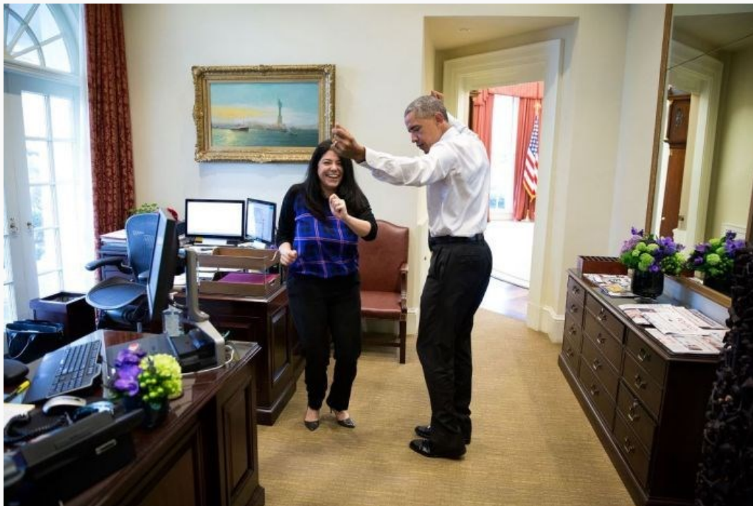
PHOTO: It is likely that some of the Obama staff might return to the West Wing if Oprah Winfrey won office. (Supplied: White House/Pete Souza)

But, no matter the inspirational leader Winfrey can be, she has yet to show she can keep a political party alive and thriving.