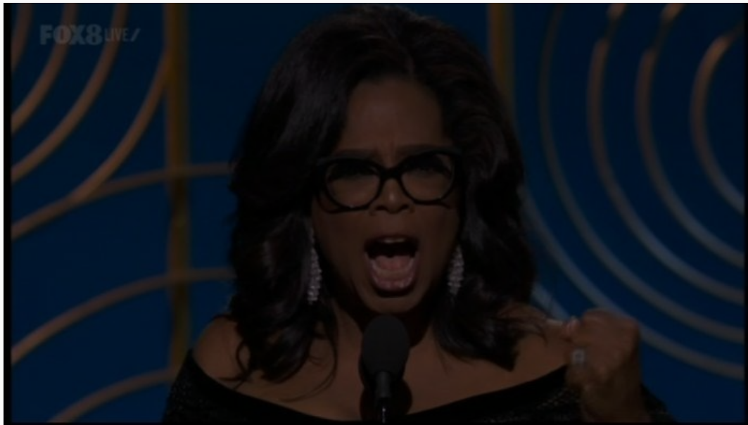
VIDEO: Oprah Winfrey is a masterful communicator, thanks to her daily talk show.

With what Democrats have been through since the 2016 American presidential election, you can't blame them for wanting to find someone who can defeat Donald Trump.