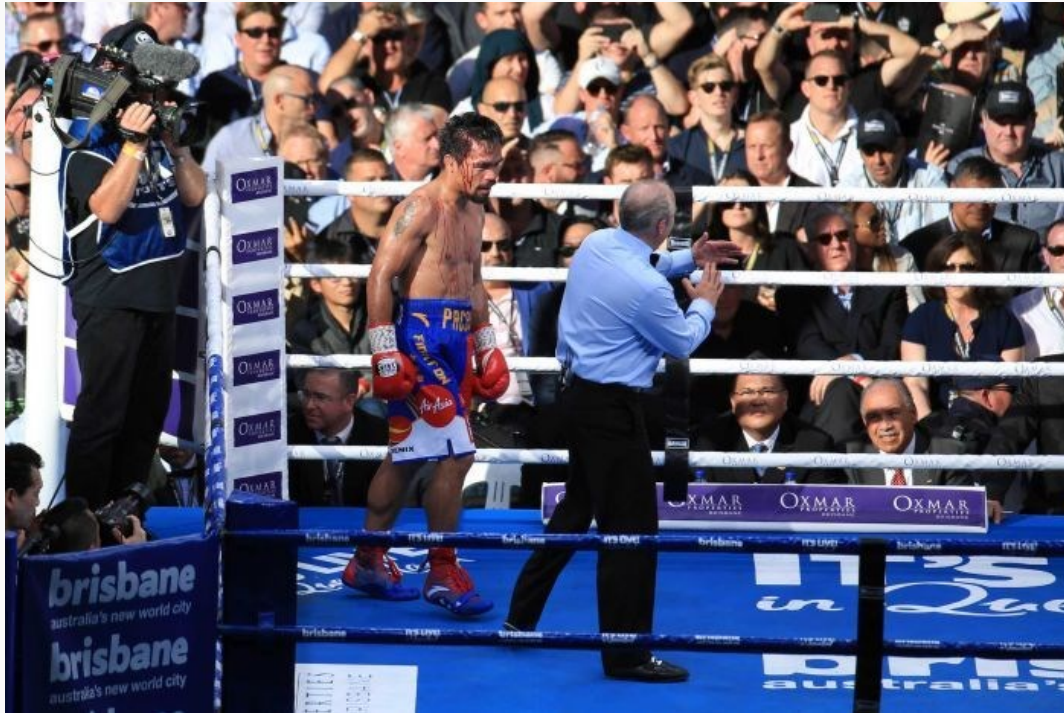
PHOTO: Pacquiao was bloodied by a Jeff Horn headbutt, but the punches did not seem to slow him.

Manny Pacquiao's Australian strength and conditioning coach has labelled the judges who awarded Sunday's Battle of Brisbane to Jeff Horn "crazy", saying the unanimous decision should have gone their way.