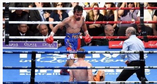
Former heavyweight champ Lennox Lewis was among those who saw Jeff Horn's win over Manny Pacquiao daylight robbery.