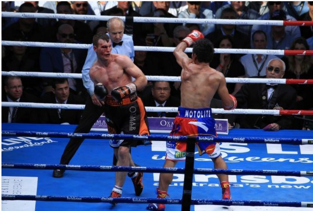
PHOTO: Horn bore the scars of a 12-round slugfest with one of the best punchers ever.

"You get given a gift sometimes, you get screwed sometimes. But when you come to someone's house you're supposed to mess them up ... never leave it in the judges' hands."