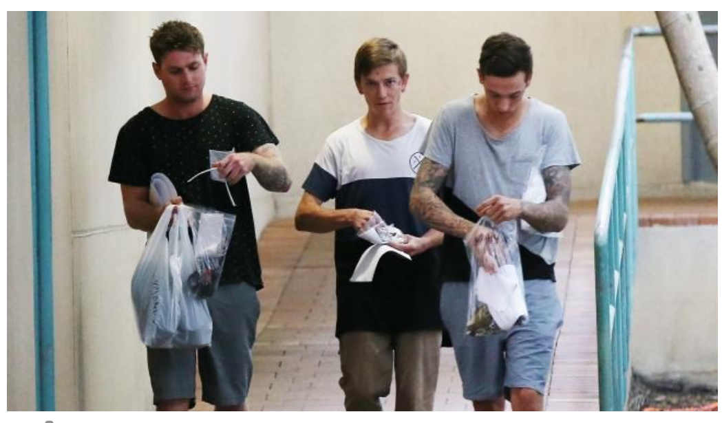
Three men charged with assaulting a Cairns police officer walk free from the Cairns watch house after a magistrate granted all three bail.

EARLIER: THREE young men charged with assaulting a Cairns police officer so seriously he was knocked unconscious have been granted bail.