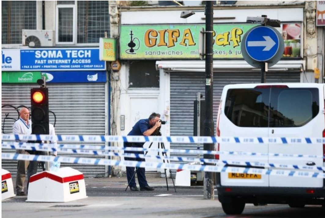
PHOTO: Police say they are not looking for any more suspects.

British Prime Minister Theresa May has visited the Finsbury mosque in London where worshippers were attending prayers before being the targets of a terrorist attack.