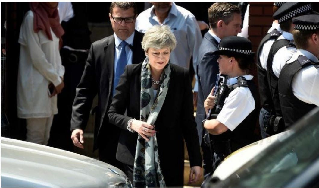
PHOTO: Britain's Prime Minister Theresa May visited the Finsbury Park mosque near where a van was driven into people.