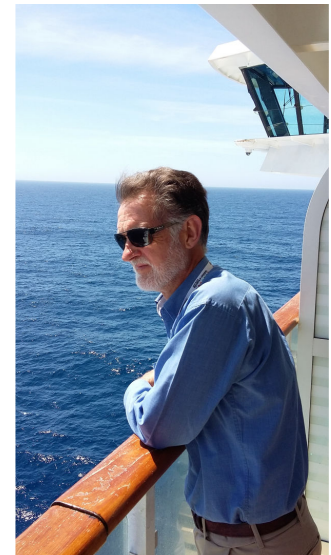
The sea was calm on the way home!!