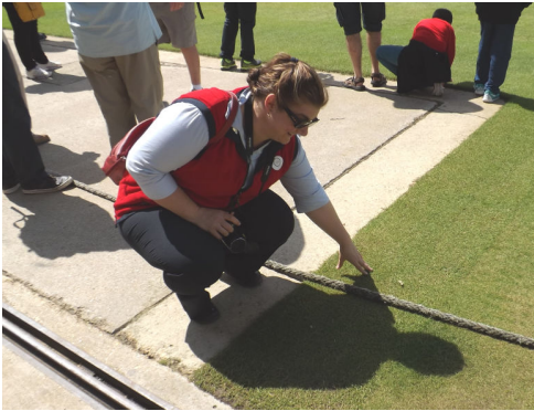
Eirona at Lord's Cricket Ground