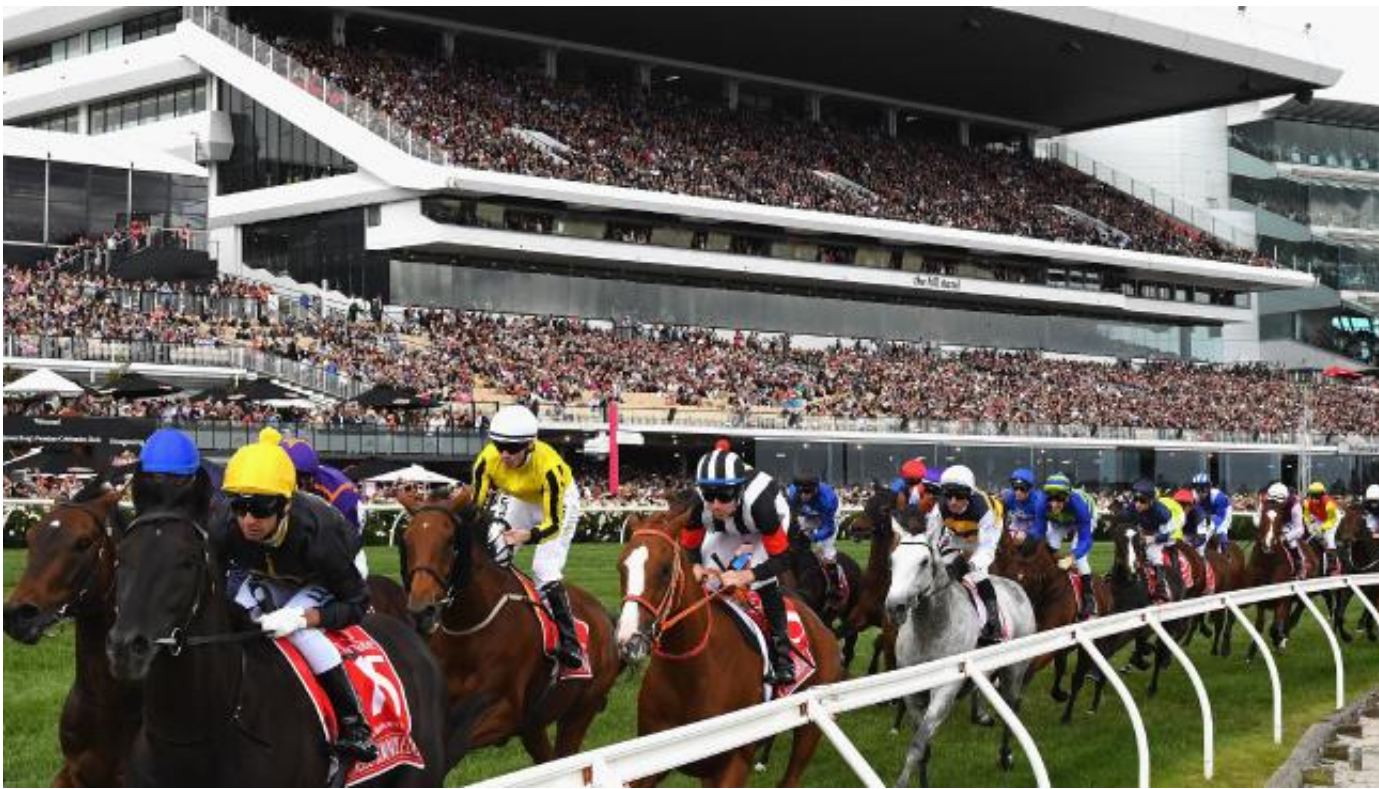
📷 Excess Knowledge leads the field out of the straight in the Melbourne Cup.