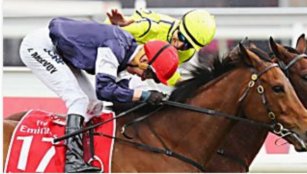
Jockey praised for 'beautiful' gesture