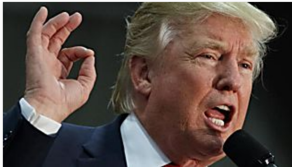
'If Trump loses, I'm grabbing my musket'