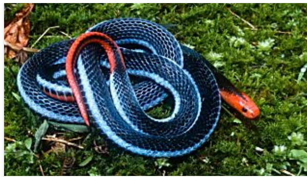
Freakish snake 'killer of killers'