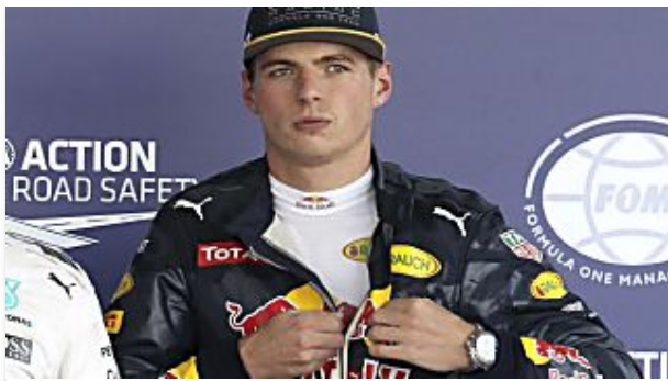
Verstappen's F1 career in danger