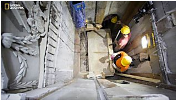
'Astonishing' discovery at Jesus' tomb