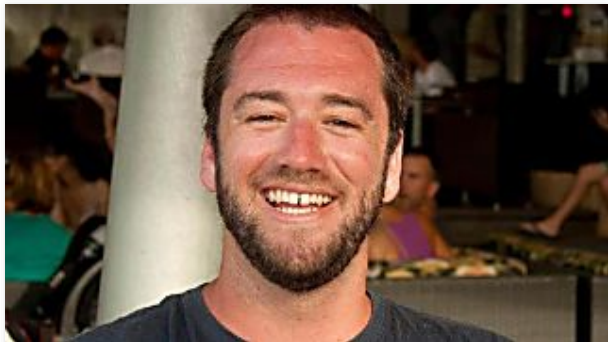
Aussie child sex predator jailed in US