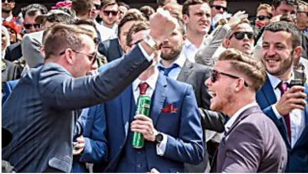
Cup punter turns $10 into $240k