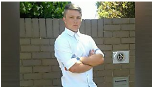
Sentence slashed for would-be rapist