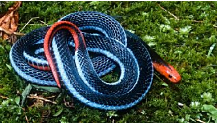
Freakish snake 'killer...