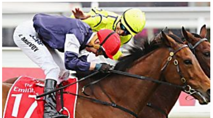
Jockey praised for...