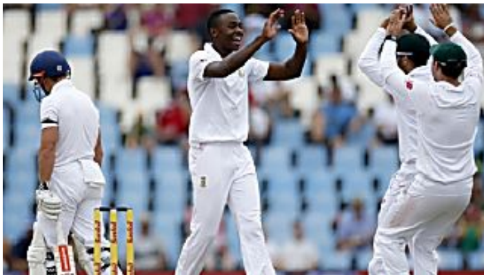
Unknown Proteas out...