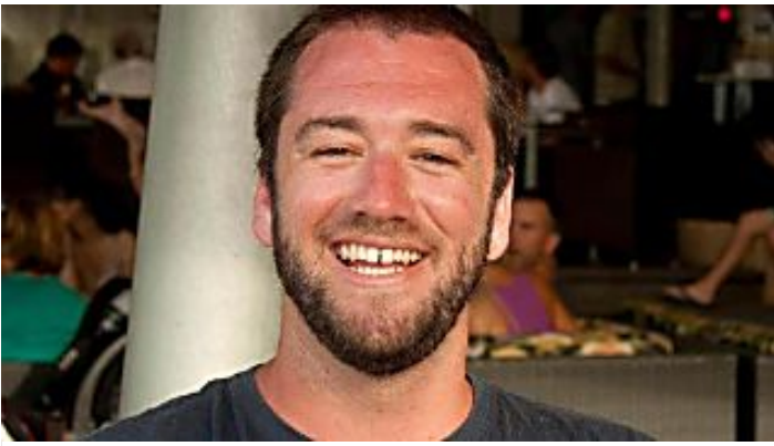
Aussie child sex...