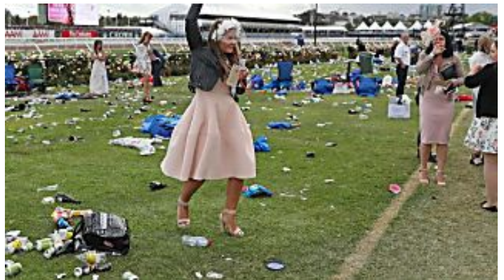
'In the toilets...