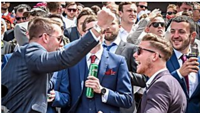
Cup punter turns...