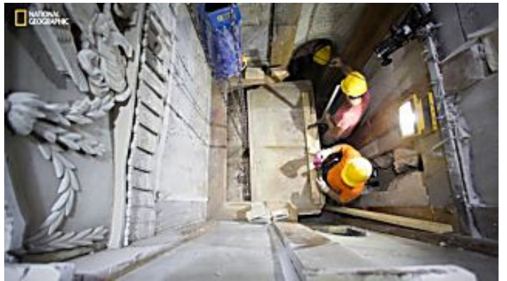
'Astonishing' discovery at...