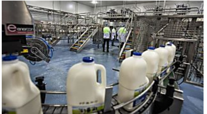
Murray Goulburn 'deeply...