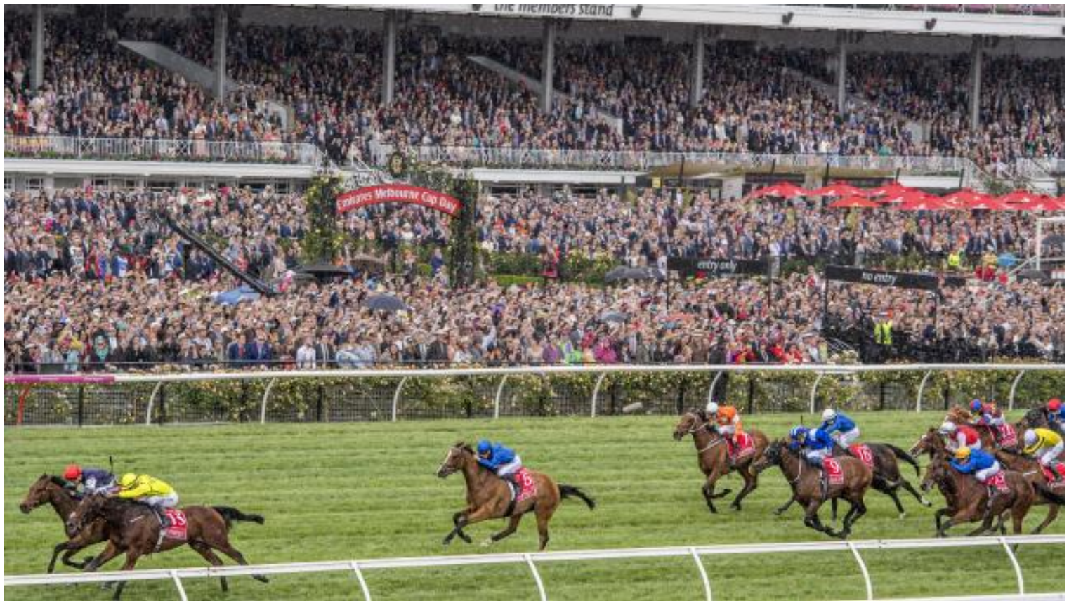
📷 The Cup field thunders up the straight in front of a big crowd at Flemington on Tuesday.