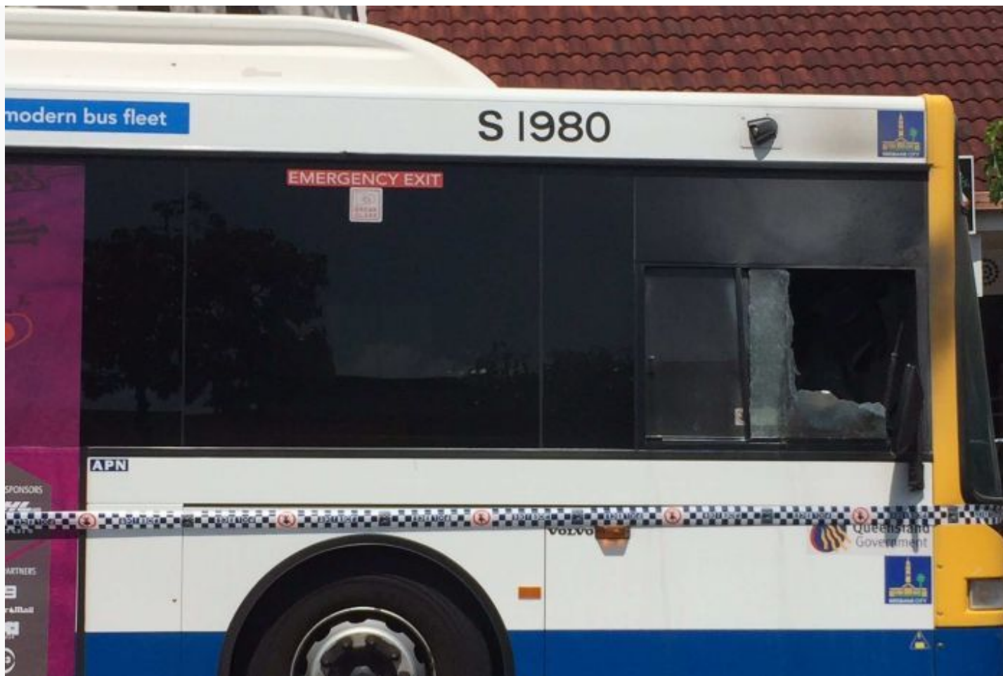
PHOTO: A man, 48, is in police custody after the alleged attack. (ABC News s: Casey Briggs)