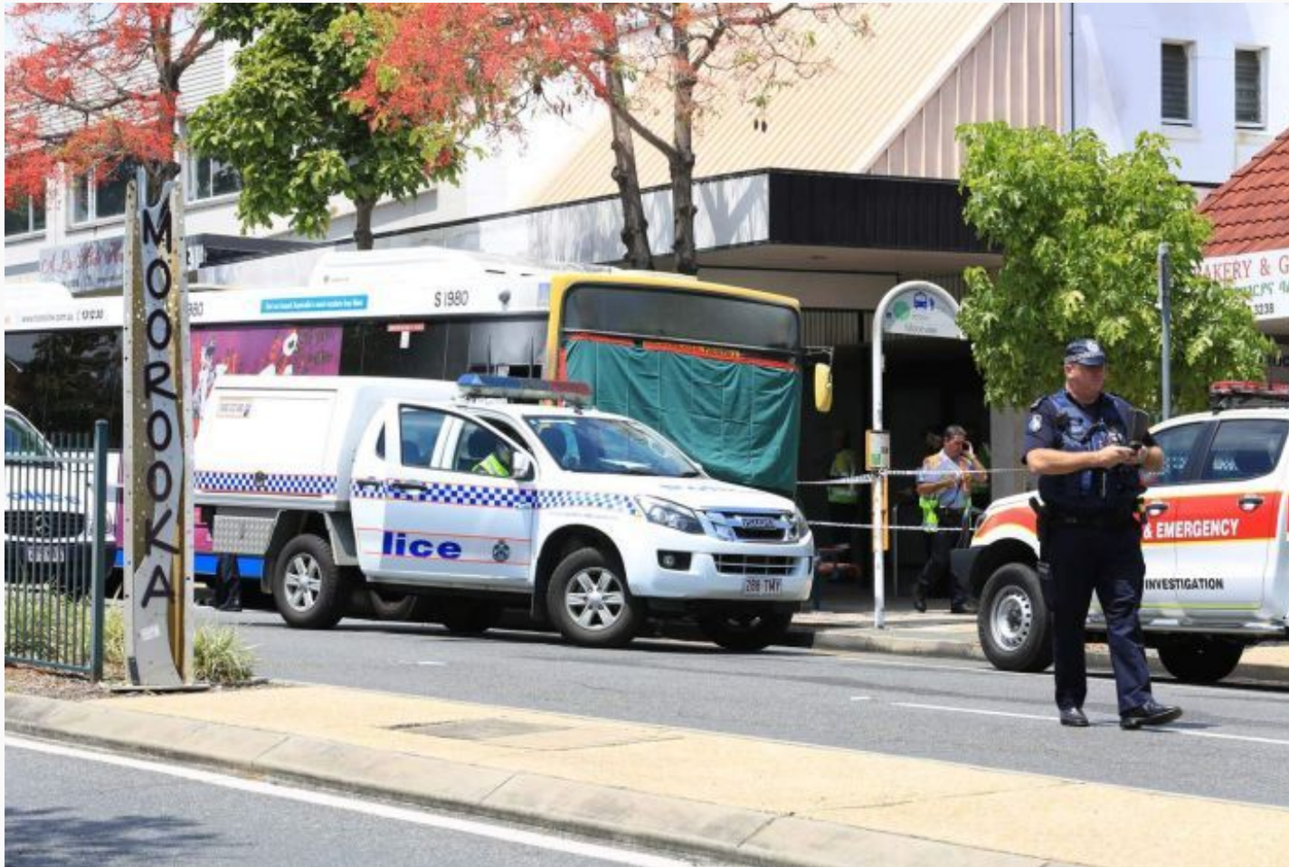
PHOTO: A witness said there were children on the bus at the time of the attack.

VIDEO: 'A senseless, needless taking of a young life': Queensland police