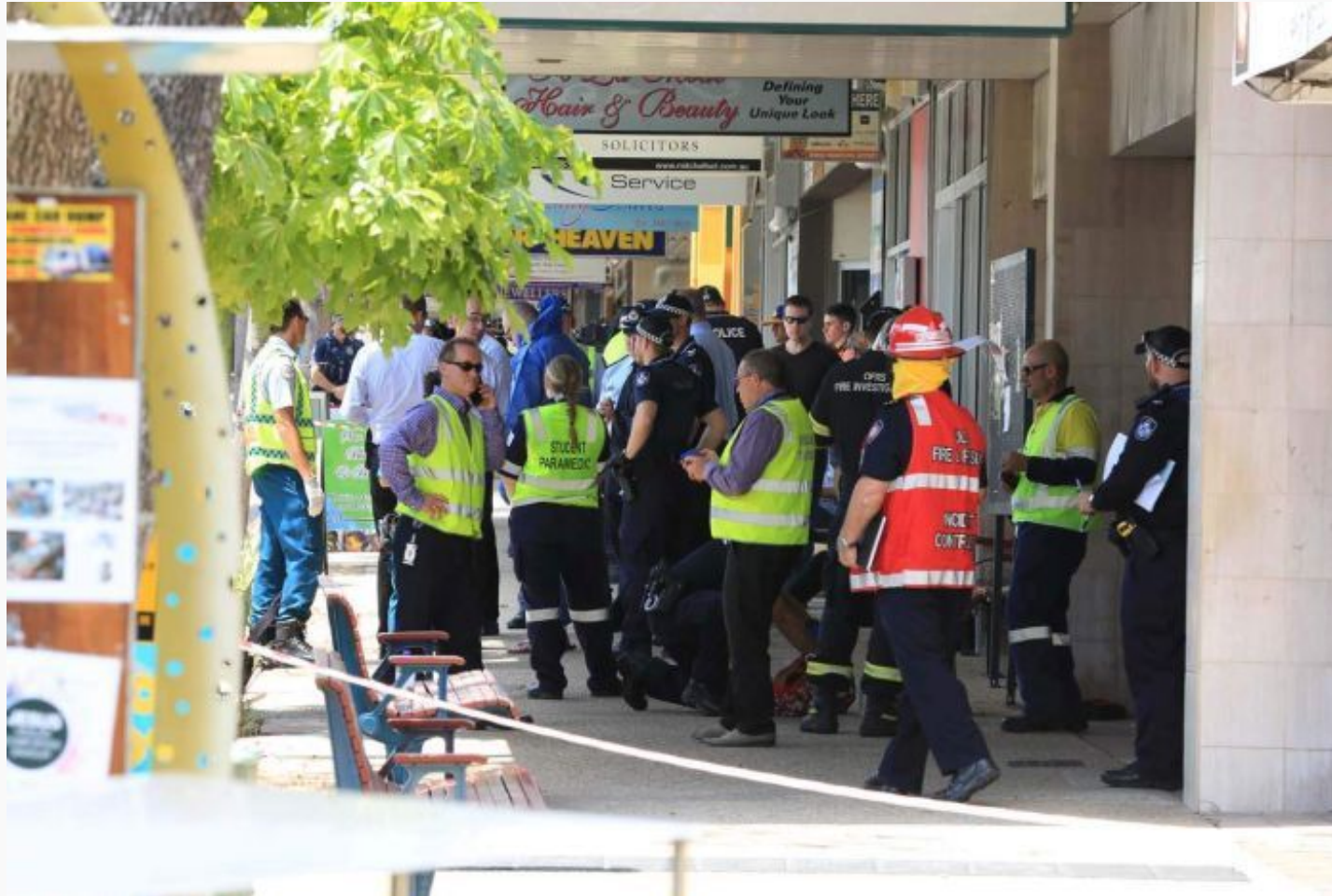
PHOTO: Passengers on the bus at the time of the attack were freed by passers-by.

"When I go I saw the bus burn, smoke coming [out]," she said.