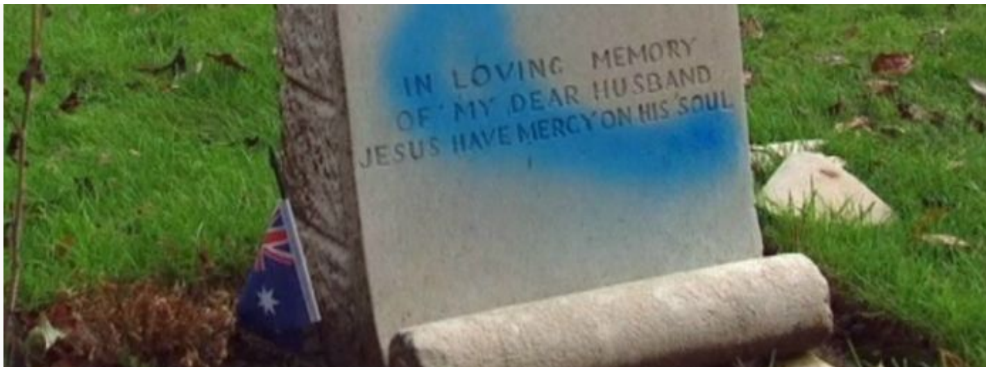
PHOTO: About a quarter of the Australian graves were vandalised. (ABC News)