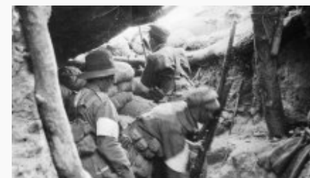
The uncensored battle for Gallipoli, tweet by tweet