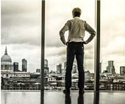
4 Billionaires Say: Something Big Coming Soon In U.S.A Stansberry Research