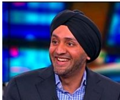
This Ex-Microsoft Exec Will Not Sleep Until He Reinvents Investing Business Insider | Motif Investing