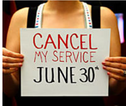
There's Trouble Brewing for America's Most Hated Companies The Motley Fool