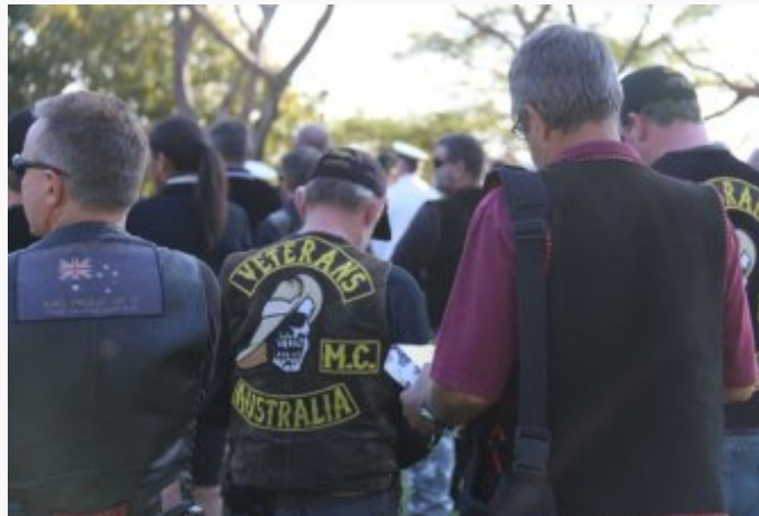
PHOTO: Veterans Motorcycle Club members at the Vietnam Veterans Day service at Darwin cenotaph.