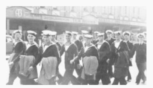
Brisbane in 1940

With the worsening economic situation involving Greece, an easy solution to the country's deepening debt crisis seems nowhere near sight.