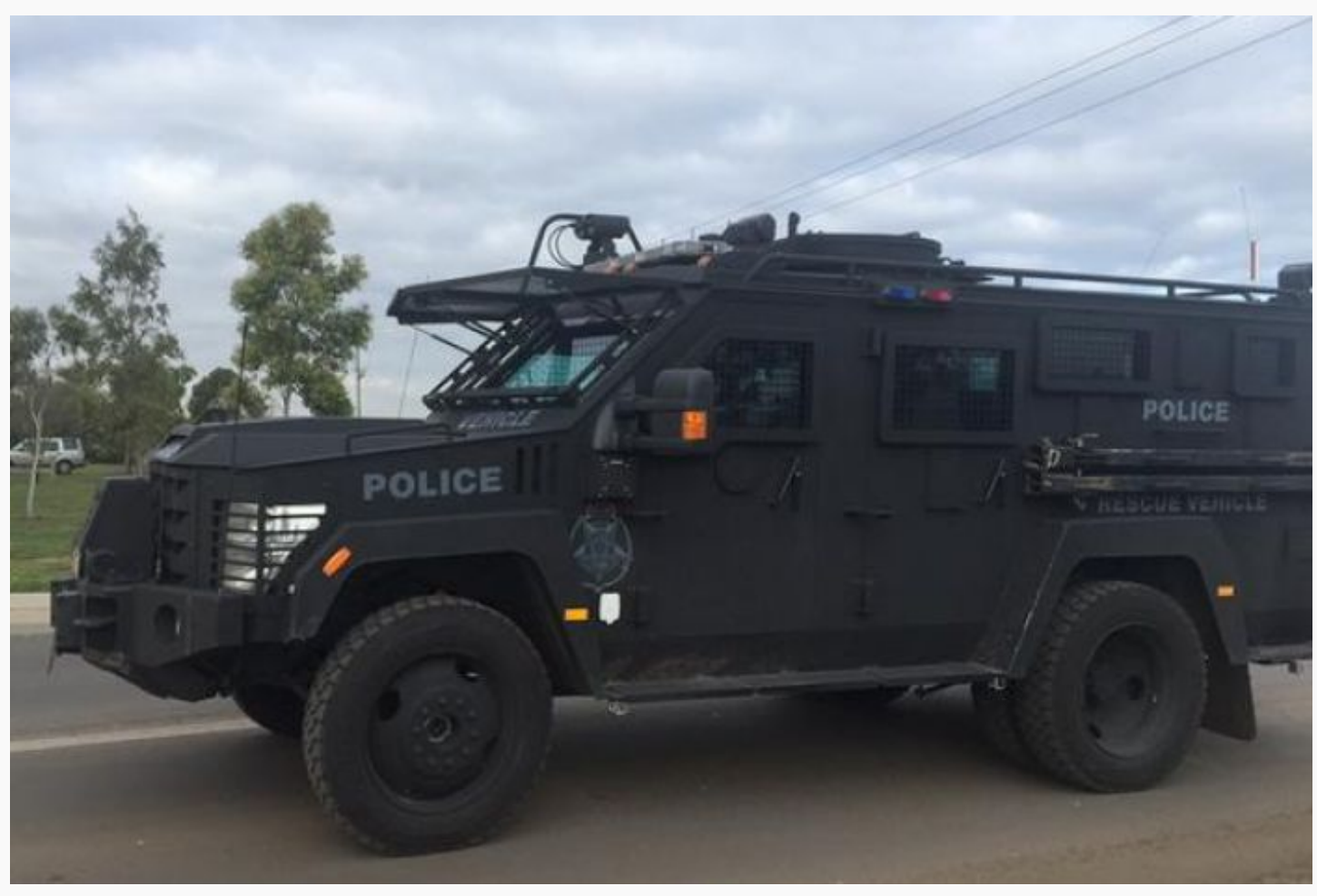
PHOTO: Police used armoured vehicles at the scene of the riot.

Commissioner Shuard said authorities would have a close look at how they responded to the prisoners' actions.