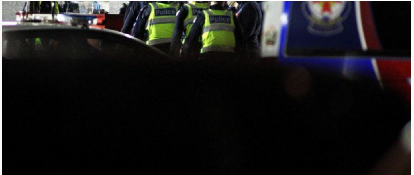
PHOTO: Police make their way to the entrance of the Metropolitan Remand Centre in Ravenhall. (Audience submitted: Patrick Herve)

About 200 staff were evacuated from the facility and all of the state's prisons went into lockdown as a precaution.