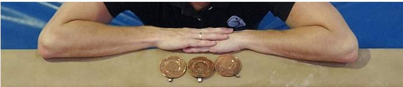
DRINK DRIVING: Former Olympic gymnast Kylie Shadbolt will undergo alcohol rehabilitation after being charged for driving six times over the legal alcohol limit.