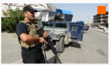
The battle for Ramadi explained