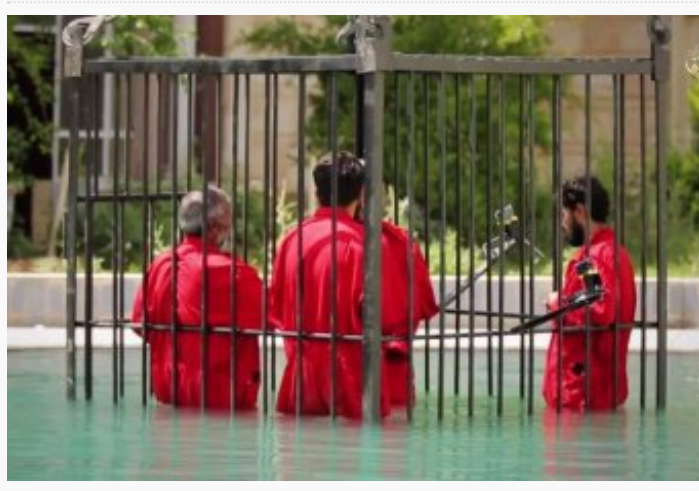
PHOTO: The Islamic State video shows four "spies" being killed by drowning in a cage.

Videos of the killings are a key propaganda tool of the jihadists, used to shock and terrify their enemies as well as to draw in new recruits seeking the most brutal and active militant group.