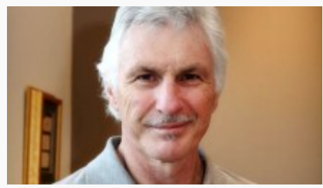
Mick Malthouse on racism, family and life after footy

Meet the radioactive you Each of us is bathed in an invisible ocean of radioactive particles and energies. You can never get away from it, because all of us are personally emitting radioactivity — 24 hours a day.