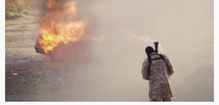
PHOTO: The video shows a militant firing a rocket-propelled grenade into a car that four "spies" were made to sit inside.

Its military gains and atrocities drew a US-led coalition of countries to launch an air campaign against it last year, as well as to provide training and arms to Iraqi forces.