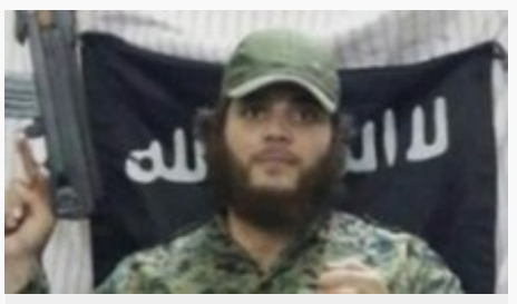
Profile: Khaled Sharrouf

RELATED STORY: Sharrouf may have been targeted in air strike months before death