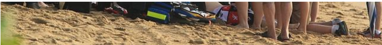
Emergency crews attend to the near death drowning of a 50 year old female competitor during the Cairns half Marathon at Palm Cove.