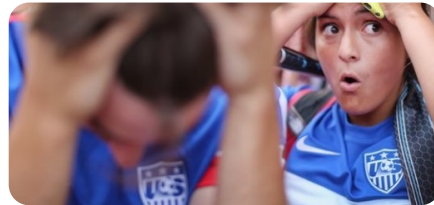
USA 2 – 2 PORTUGAL