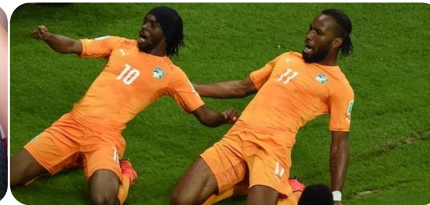
IVORY COAST 2-1 JAPAN